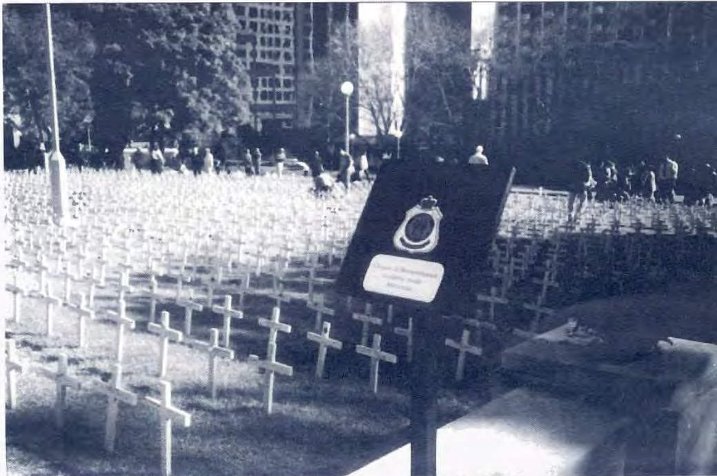
Thousands of crosses in remembrance were placed here on 15/8/95. They were to be burned and the ashes scattered around the War Memorial in Hyde Park.

On 15 August along with so many Australians we lined the streets of Sydney for the ticker-tape parade to pay tribute to the men and women who gave their all to protect this great country of ours and to remember those who had fallen.