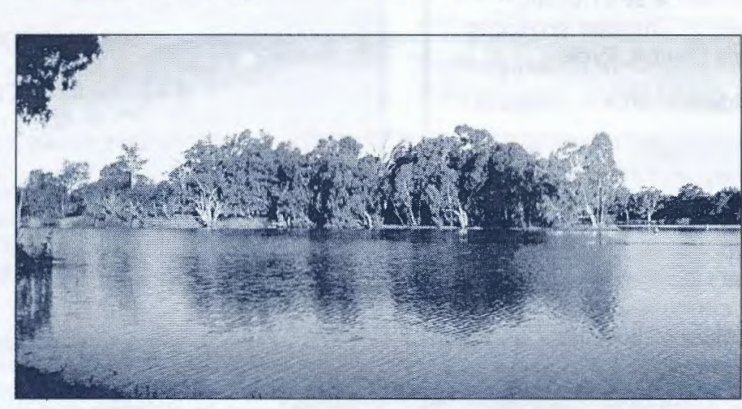
The Murray/Darling confluence

along the M4 tollway via Parramatta to the Blue Mountains, with the first stop at Echo Point, Katoomba. This was the first visit to the area for some and the clear weather showed off the spectacular views of the Three Sisters and the Jamieson