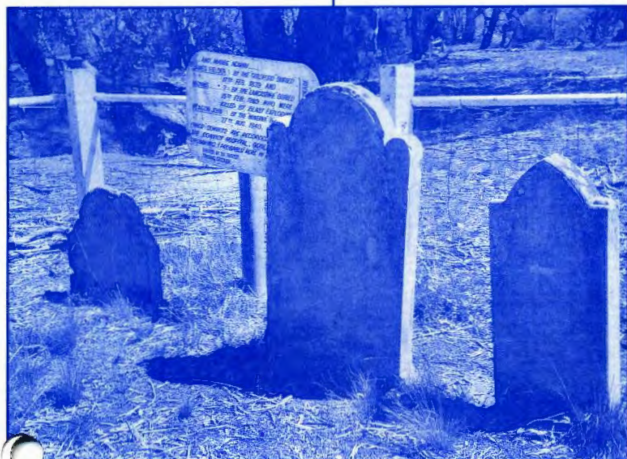
The three graves.