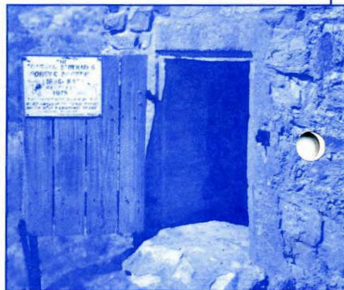
The Powder Magazine

The excavation of this site exposed a stone hearth and base layout of one of these huts. Ash within the fireplace contained fragments of bone, glass and clay pipestems. The rectangular building was approximately 3700 x 7920 mm (12 x 26 ft), with the hearth in the centre of the long north wall. All walls were of pise construction. A drip-line along the Eastern and Western walls indicated a hipped roof. Various artefacts found at this site are in the care of the Goulburn City Library.