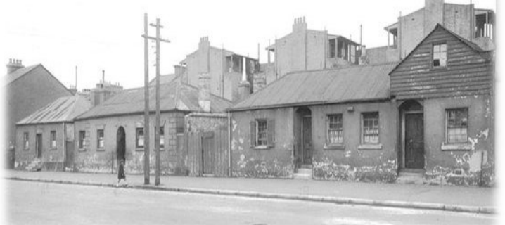
Prince St, Millers Point, before demolition for Bridge