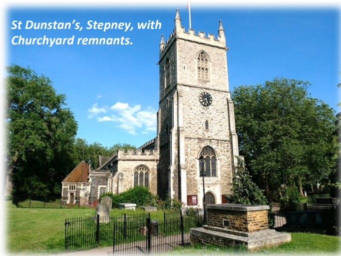
St Dunstan's, Stepney, with Churchyard remnants.

What was you robbed of? - I was robbed of three guineas and a half, and some silver, and a cane.