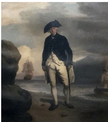
Portrait of Governor Arthur Phillip which hangs in the entry hall

This gave Phillip the authority to govern alone over the eastern half of the continent, according to British Law.