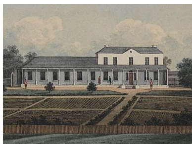
First Government House, demolished. At the Museum of Sydney an external plaque marks its replacement

On Thursday 9 th February 2023, 85 guests were warmly welcomed and encouraged to wander throughout the building and gardens while sipping a champagne or soft drink. Unfortunately a major thunderstorm and torrential rain prevented a few people from travelling to the event.