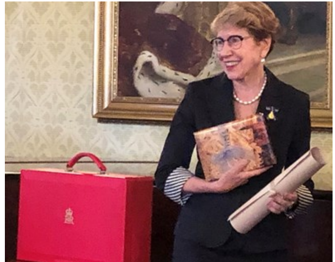
The Governor holding the FFF book and Scroll of Loyalty, alongside the Red Dispatch Box

Phillip left the colony due to ill health on 11 December 1792, intending to return but that was not to be. Returning to active duty in 1798, he was appointed commander of the Hampshire Sea Fencibles, established to protect the county against an invasion by Napoleon . He died on 31 August 1814, having risen to the rank of Admiral, his death following a fall from the window of his home in Bath. He had, it seemed, suffered a stroke sometime earlier. He is buried in St Nicholas' Church in Bath, where we attended a commemorative service in June 2022, on which occasion the Church flew the NSW