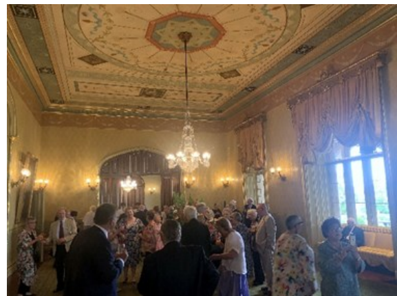
Members circulating in the Ballroom