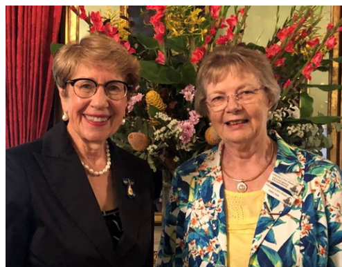
The Governor with the Vice President