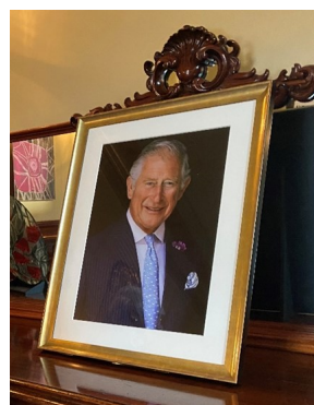
King Charles III – official photo