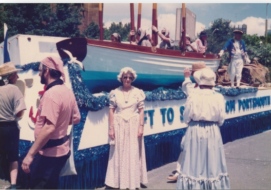
The replica of the gig belonging to Captain Arthur Phillip which was presented to the City of Sydney by the City of Portsmouth

I well remember Australia Day 1988. It began the night before when we celebrated with a dinner at the Wentworth Hotel. Bob Hawke was dining in a room next door and at 5 to 12pm rushed in and up on the stage. He gave a short talk and then disappeared again. We broke up and I called for our cars to be brought up. By this time it was very late (early in the morning). It took me 1 hour to drive over the bridge to Lane Cove. I no sooner got to bed and it was time to get up as we were invited to have some breakfast at a park. I met my sister on the train at about 6 o'clock in the morning. Then we went across to the Opera House. Members of the First Fleet had been given a pass which allowed them onto the steps of the Opera House. Eventually the arrival of Prince Charles and Diana with much cheering. They faced away from the steps towards the fixed seats where people who had been invited sat. After their speech they came into the Opera House and disappeared inside. We watched the arrival of the tall ships as they came in and sailed around. That night my husband and self and children (and dog) went down near