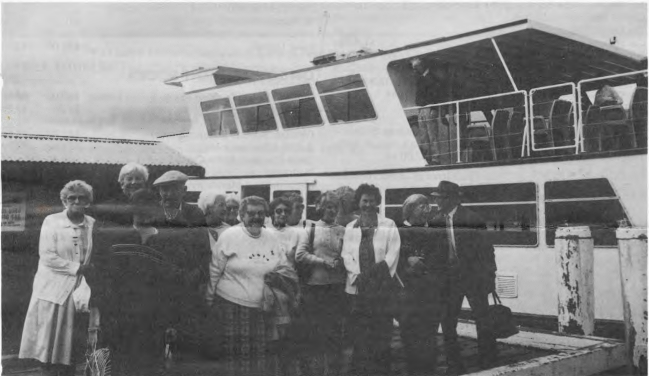
The Daytime Fellowship Group about to board the launch at Brooklyn for the Postal Run on the Hawkesbury River